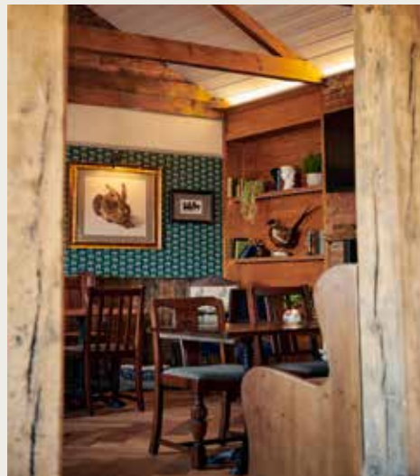
TOP: THE BARN DINING ROOM BOTTOM LEFT: THE LODGE BOTTOM RIGHT: THE ENCLOSURE